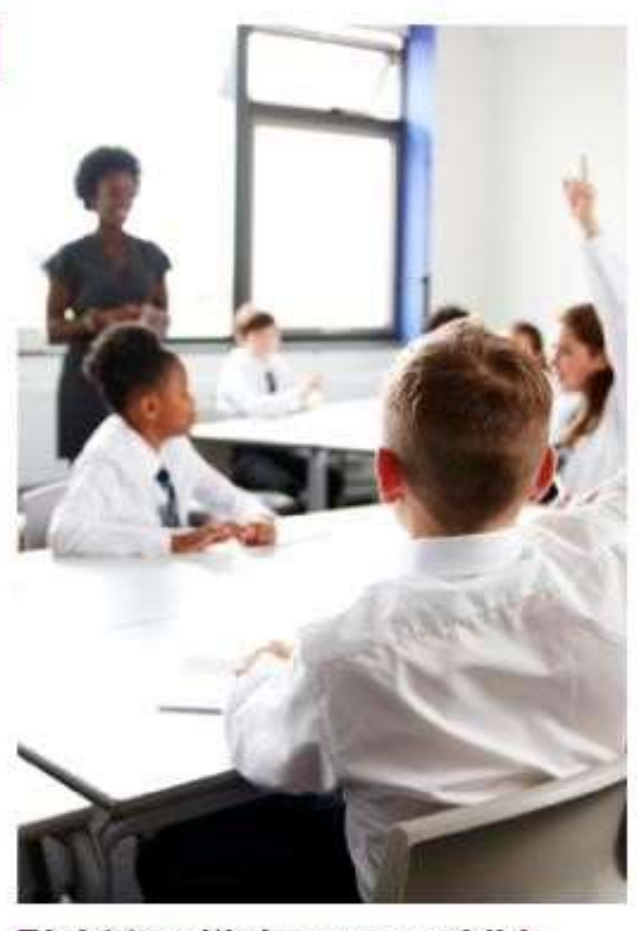
Right to withdraw your child

You can find further detail by searching 'relationships and health education' on GOV.UK.